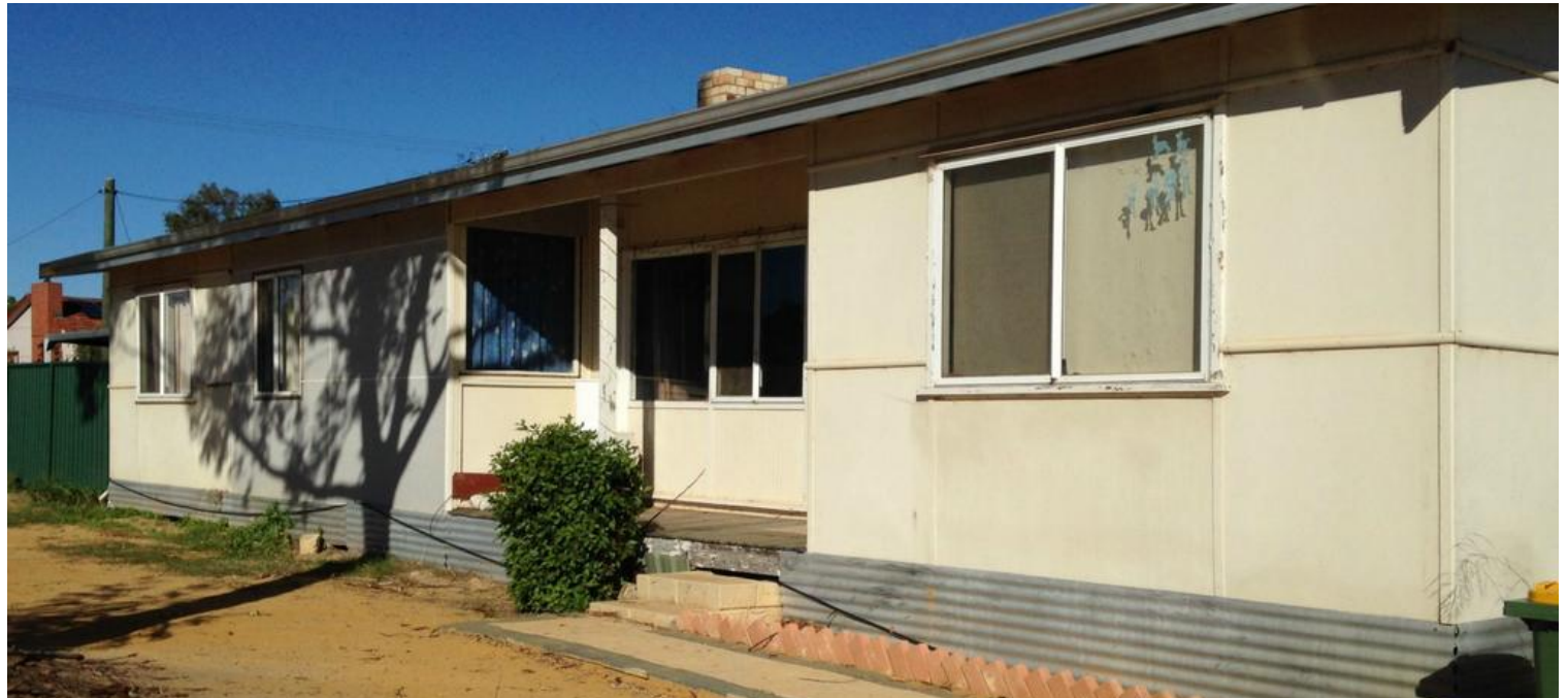
3 Hilda Street, Dowerin