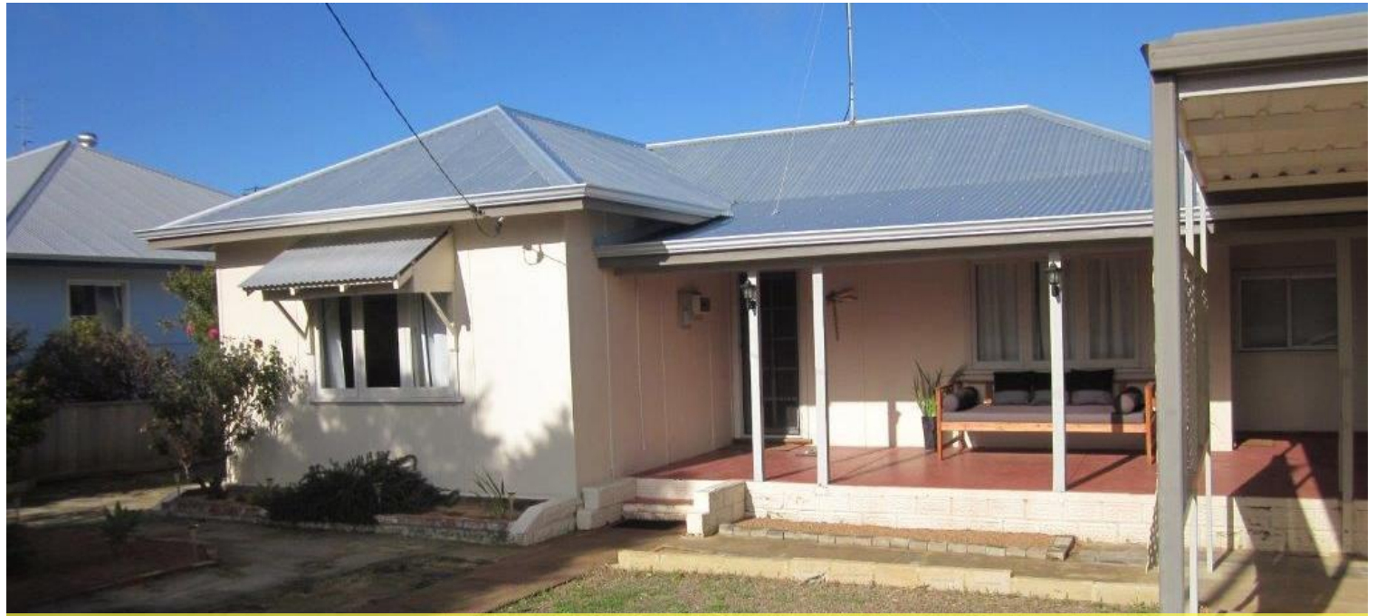
9 Slocum Street, Wyalkatchem