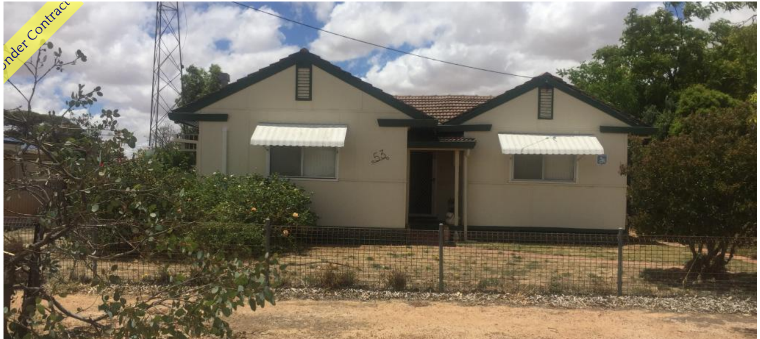
53 Flint St, Wyalkatchem